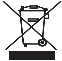
Wheelie Bin Logo

As the WEEE directive applies to self-contained operational electrical and electronic products, this end of life take back service does not refer to other Thorlabs products, such as: